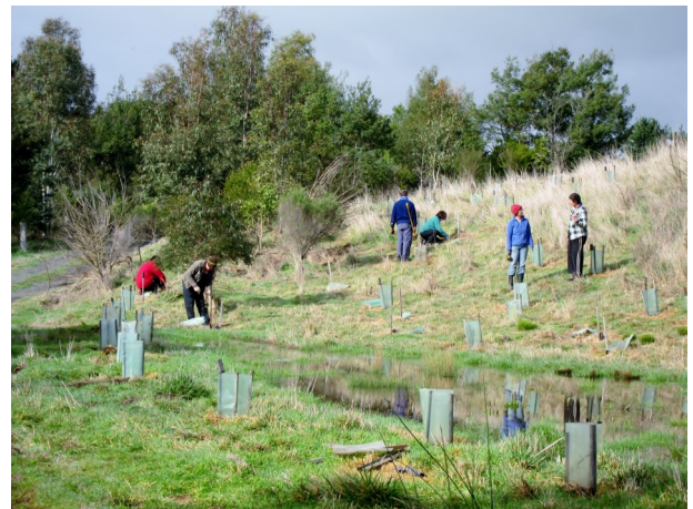
Result: 2500 plants –230 people