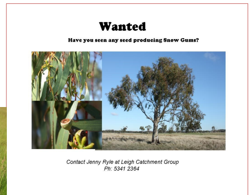
Above: Wanted posters to raise awareness of the issue.

Lower Middle: Distribution maps from Ballarat Biodiversity Services helped locate potential seed sources where we could collect under permit from the Department of Sustainability and Environment