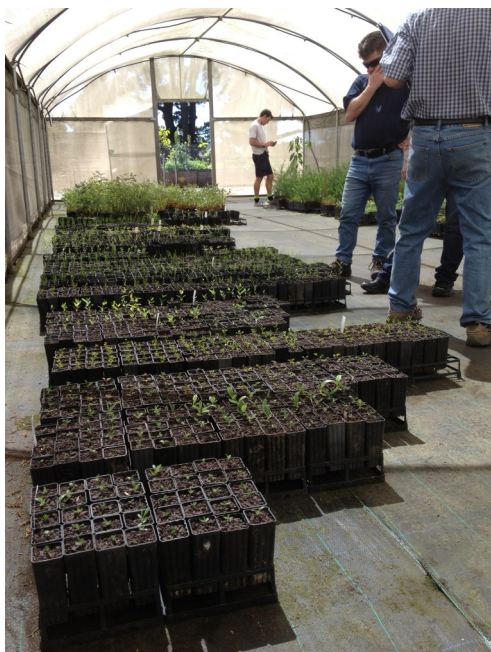
Above: The propagated seeds are grown on in the Community Nursery in Ballarat, where the propagation workshop was held in March.

This is the first year of a Communities for Nature project funded by the State government for three years. The project is based on providing a good supply of the right species for the ecological vegetation classes around Buninyong. Awareness raising of the issue generated plenty of interest by local landholders within the targeted EVC's. The target was to plant over five hectares of revegetation containing an appropriate percentage of the focal species.