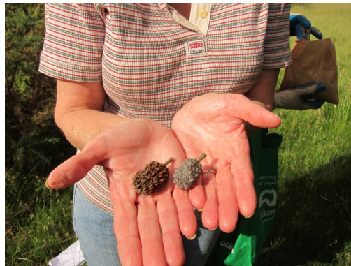
Above: Black Sheoak cones