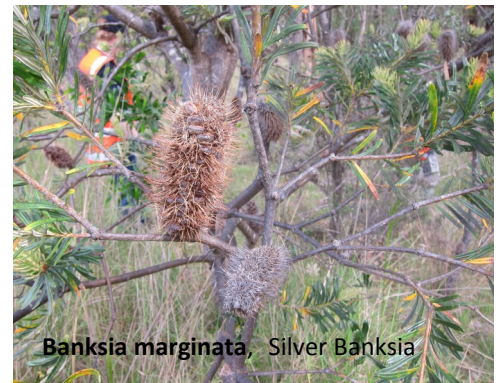
Banksia marginata , Silver Banksia