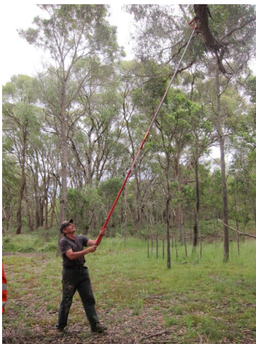
Above: Collecting Yarra gum nuts with a pruning saw and pole. See front cover.

Lower Middle: Distribution maps from Ballarat Biodiversity Services helped locate potential seed sources where we could collect under permit from the Department of Sustainability and Environment