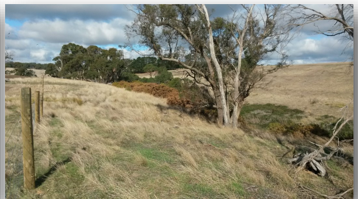
Fencing, Gorse and Blackberry Control on the Yarrowee River, Grenville.