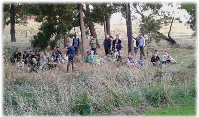
Above left: Brunch with the Birds event at Ditchfield Reserve in Brown Hill; Above right: Frog Walk and Talk. Middle left: Botanic Drawing by the River event. Middle right: Soil testing as part of the Small Farm Planning workshops. Below: New Cal-