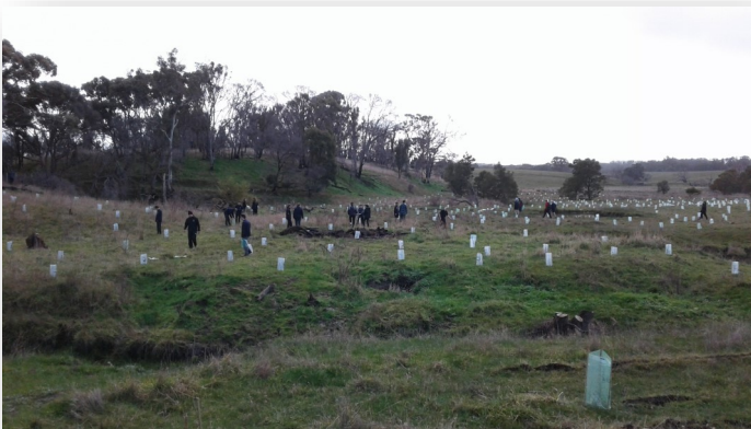
Covenant College students tree planting, Williamsons Creek, Elaine

The local community assisted delivering the tree planting component of these projects. Secondary school students, local businesses, and prisoners in Landmate Program helped plant the trees.