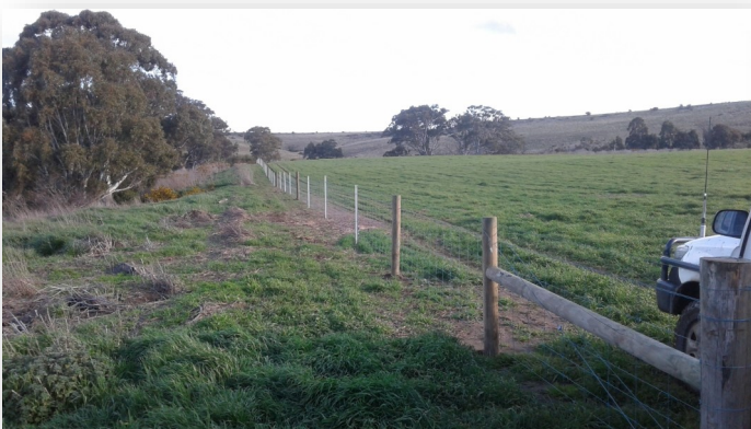
Fencing Leigh River, Bamganie to prevent livestock Access to stream and protect Remnant Vegetation.