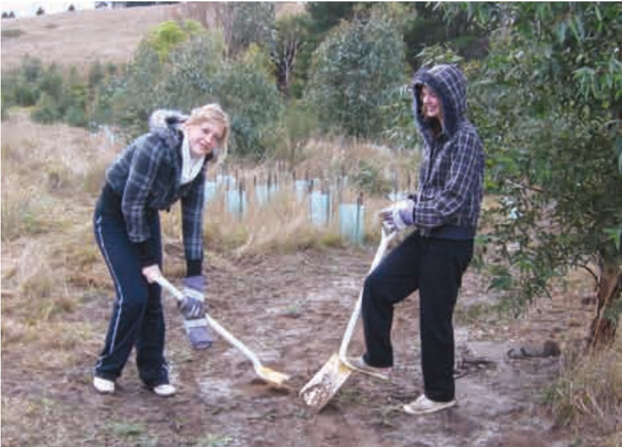
Above: The challenge of transforming an eroded weedy riverside wasteland into a patch of local bush, south of Buninyong attracted such wide community interest that a local group was formed.