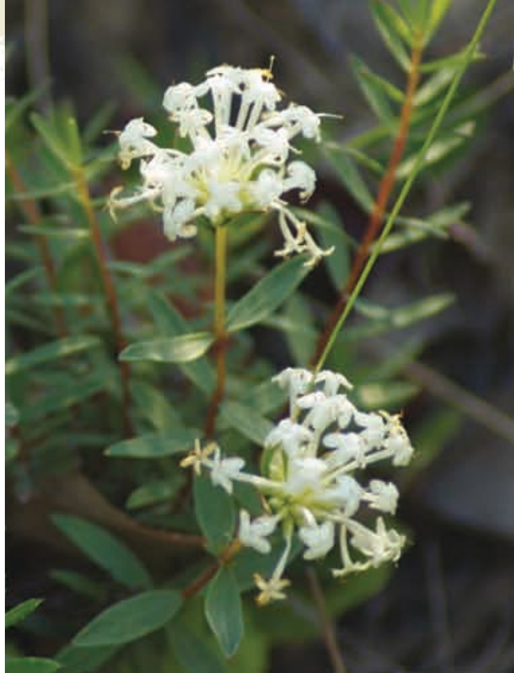
Above: Pimellea Curvifolia - Curved Rice Flower was one of the native wildflowers that reappeared under careful management.