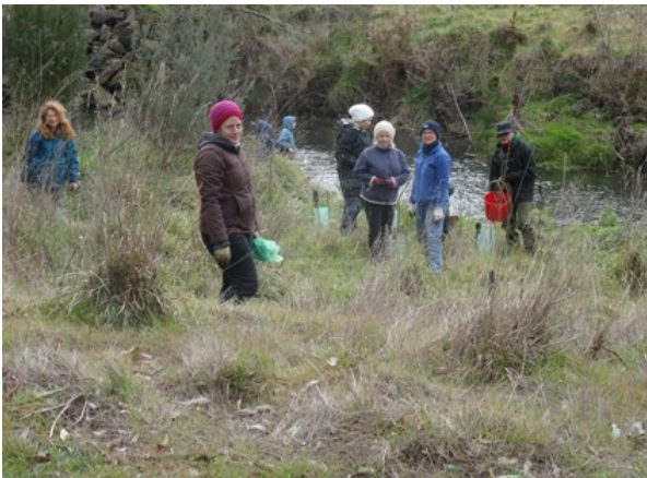
Enthusiastic landcarers stopped in their tracks for a photo

It's amazing what can be achieved in just a couple of hours with a small group of people!