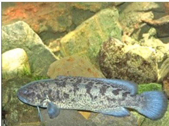
River Blackfish

*If you identify anyone doing illegal activities in waterways, ring 13FISH (133474) Hotline*