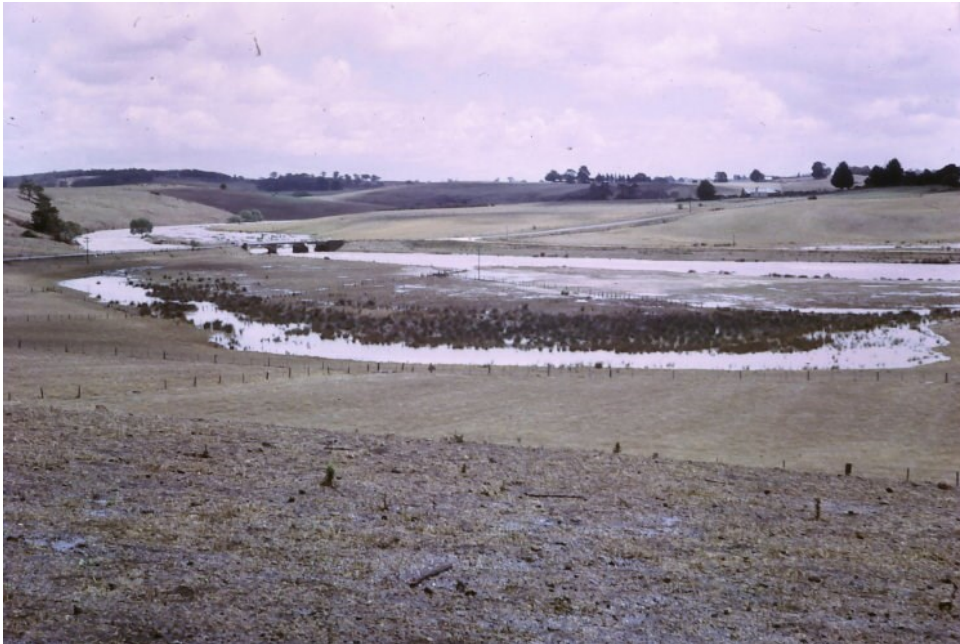
Historical photograph of the Garibaldi Bridge during floods in 1960s taken by a community member. Notice the vegetation growing along the river compared to now.