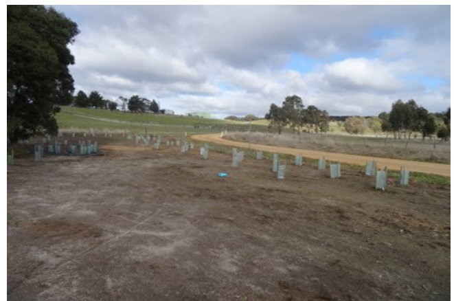
Recently tidied up area on roadside now planted out.