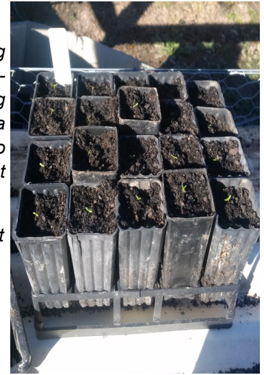
The transplanted seedlings