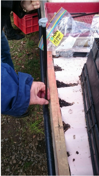
Attaching the watering system to the bench.

Two of our GLG members were generous enough to run practical workshops over two separate days in May on the practice of how to transplant native seedlings and also set up a watering system to keep them growing. Gemma Wilson hosted the workshops at her house (and also provided wonderful baked goodies) and Linda Wright demonstrated how to do the pricking out and other aspects of transplanting and propagating. The two photos below illustrate a bit of what was covered in the workshops. If you would like to learn about transplanting or how to set up your own watering system for your plants, contact Linda Wright at: jimnlinda@optusnet.com.au so we can organise more workshops in 2016.